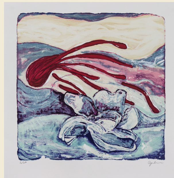
Polvo , 2023. Litograph. 40x39cm

based in São Paulo, Brazil] curator and researcher in contemporary art and architecture, she graduated from the University of São Paulo with a Master's degree in Theory and Aesthetics of Art. Additionally, she holds also a master's degree in Philosophy of Art. Currently pursuing her Doctorate, her research focuses on the role of women photographers in the Amazonian region during the dictatorship. With over 10 years of institutional experience, she has curated exhibitions and conducted research on significant Brazilian female artists. She also participated in several juries for art, architecture and design awards. In 2020, she was honored with the Jabuti Prize, the main Brazilian literature award, in the Arts category. She was also a finalist in 2023 for her book "Tomie," dedicated to the Japanese-Brazilian artist.