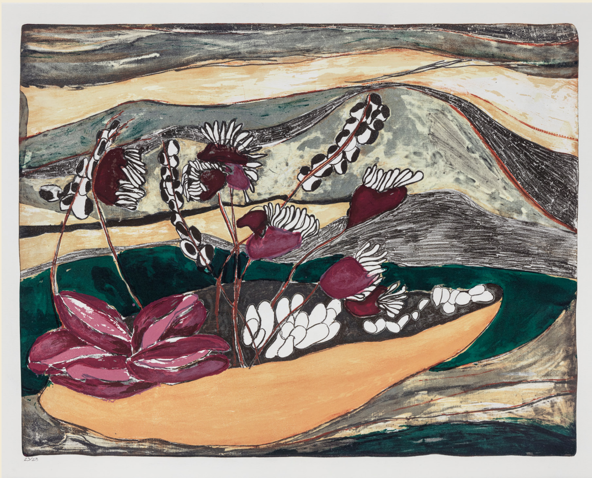
Carnivorous Egg Boat Pizza, 2023 Litograph. 59,5x75,5cm