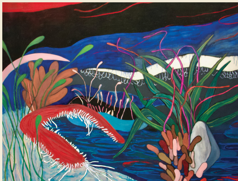
Tube Feet, Spine Teeth , 2024 Charcoal, dry pastel, oil bar and oil on linen 147x196cm